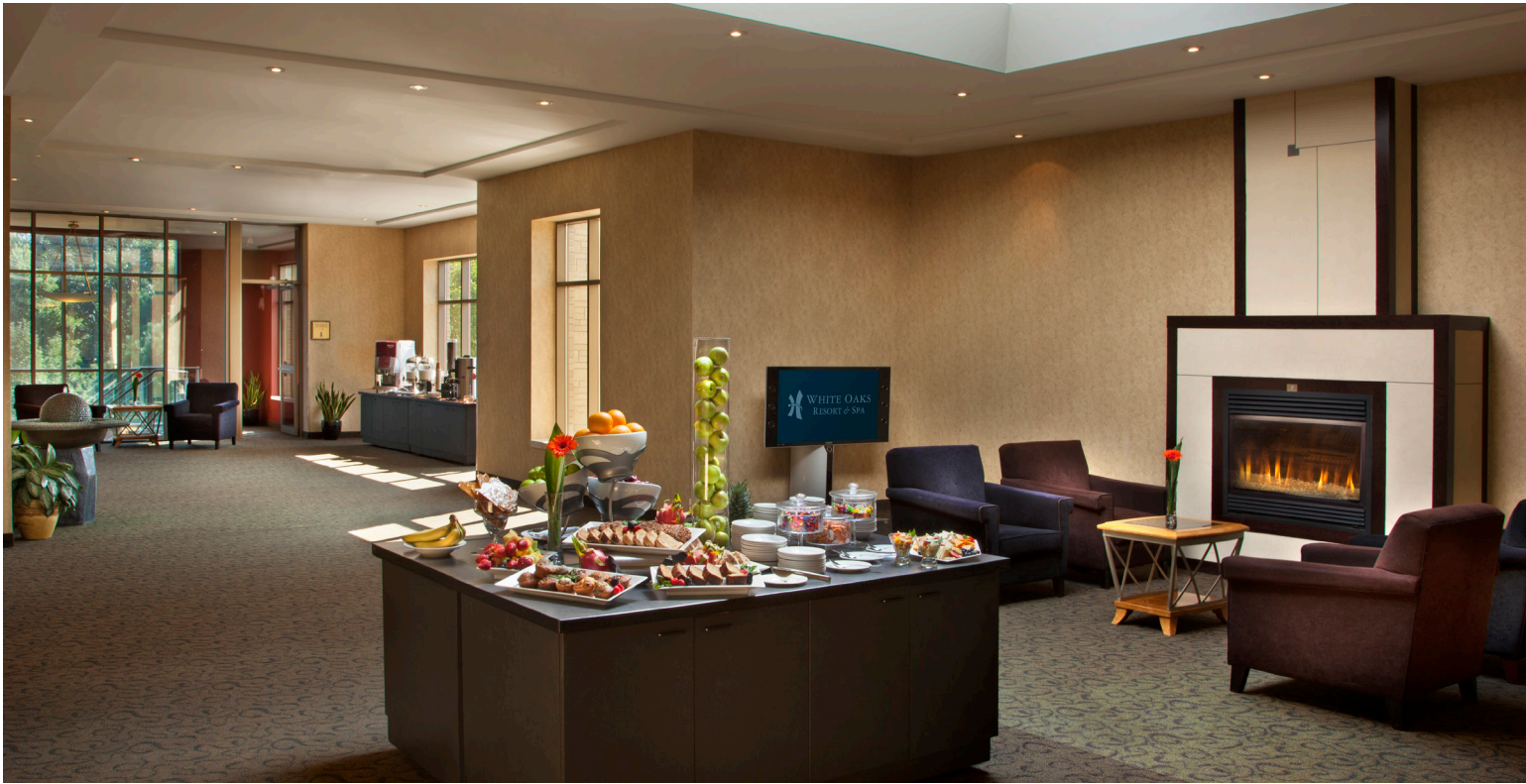
Intimate lounge space adjacent to Studio 12/13, with a magnificent second floor view of the gardens and property.